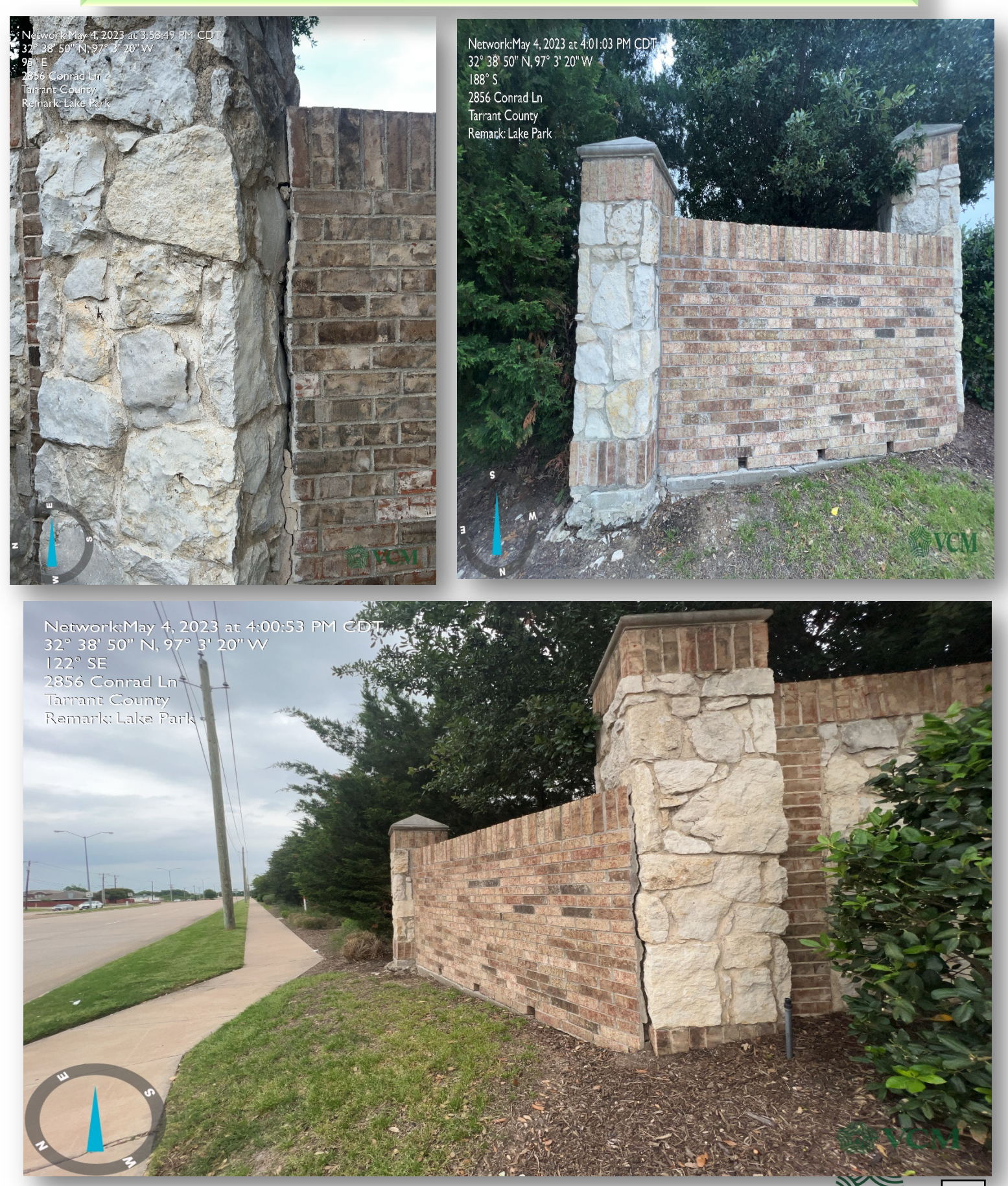
Thank you for allowing VCM, Inc. to serve your community!